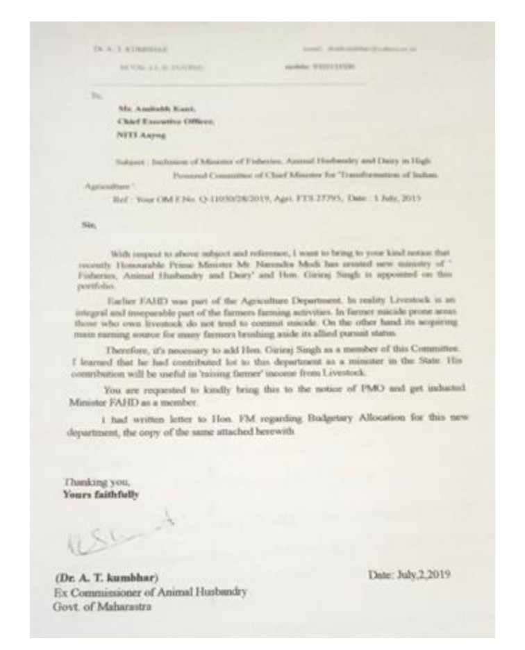
HIGH POWERED COMMITTEE OF CMS--MINISTER OF FAHD NOT THERE